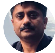
Nisheeth Dixit Advocate, Supreme Court of India