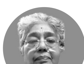
Geeta GAURI Former Member of Competition Commission of India