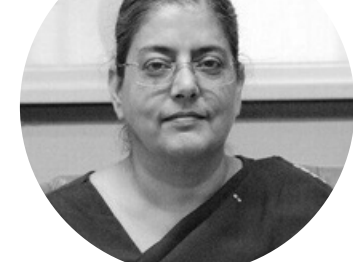
Ravneet KAUR Chairperson, Competition Commission of India